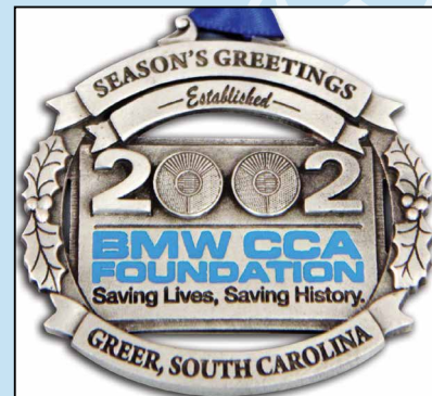
The all-new Ornament all 2002 fans must have. Display it all year long.