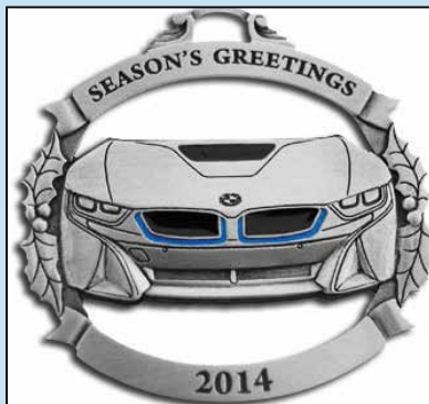
Introducing the Limited Edition BMW i8 Ornament for 2014!